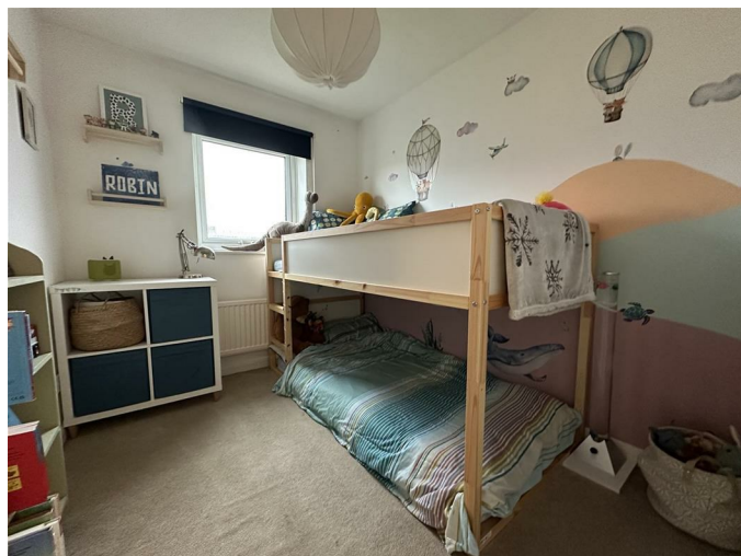
Bedroom Three 9'01 x 7'03 (2.77m x 2.21m)

Double glazed window to the rear and radiator