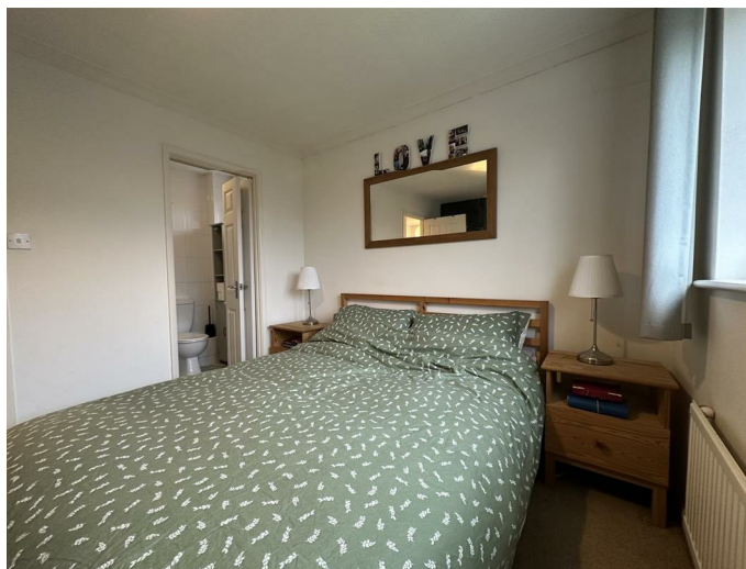
Bedroom One 11'07 x 9'02 (3.53m x 2.79m)

Double glazed window to the rear, radiator and door to the en suite.