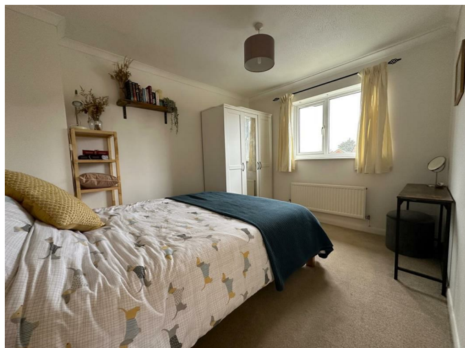
Bedroom Two 11'04 x 9'05 (3.45m x 2.87m)

Double glazed window to the front and radiator.