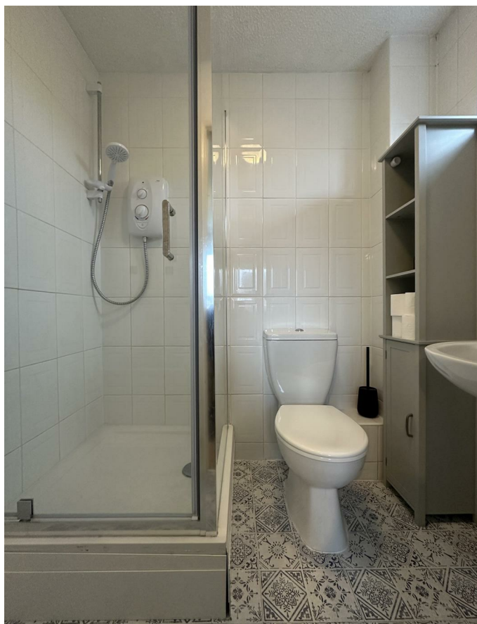
En Suite 6'03 x 4'09 (1.91m x 1.45m)

Double glazed window to the side, radiator, toilet, wash hand basin and shower cubicle.