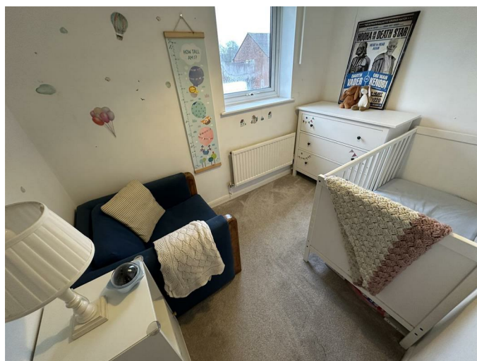
Bedroom Four 9'05 x 6'02 minimum (2.87m x 1.88m minimum)

Double glazed window to the front and radiator.